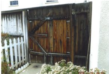
Before & After